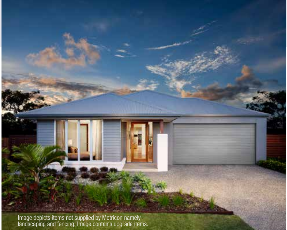
Image depicts items not supplied by Metricon namely landscaping and fencing. Image contains upgrade items.

As you would expect, every MetInvest by Metricon package has an impressive “turn key” list of inclusions as standard – including: