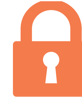
Security & Automation